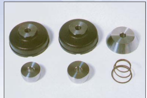
TK4-1 Heavy-Duty truck adapter set